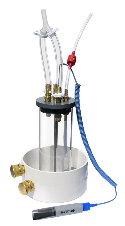
The RAD AQUA accessory

This accessory enables users to accurately measure radon in large water samples of up to 2.5L in volume, collected in standard soda bottles or glass jugs. Large samples allow for greater precision and lower limits of detection. Radon concentrations of as low as 1 pCi/L (37 Bq/m³) can be detected with a sufficiently large sampling bottle. The upper operating limit of the Big Bottle System is 10,000 pCi/L (370,000 Bq/m³). Ranges higher than that are detectable with the RAD H<sub>2</sub>O accessory.